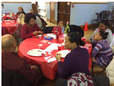
Agape Meal/Valentine's Day Luncheon for New Members

OLD BERGEN CHURCH 1 HIGHLAND AVE JERSEY CITY, NJ 07306 201-433-1815 CHURCH OFFICE M-F 9:30 am-2:30 pm www.oldbergenchurch.com